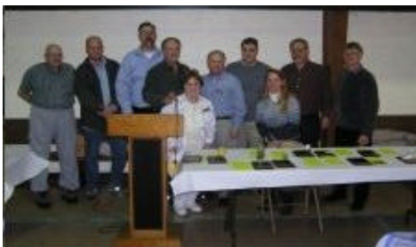
2006 Officers & Board Members